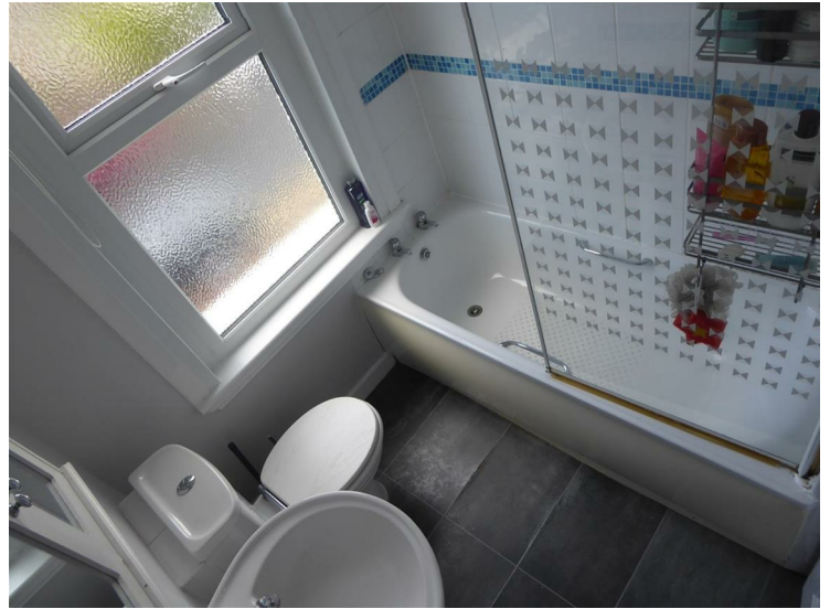
White suite comprising panel enclosed bath with wall mounted shower unit, pedestal wash hand basin, low level w/c, part tiled walls, front aspect double glazed window.