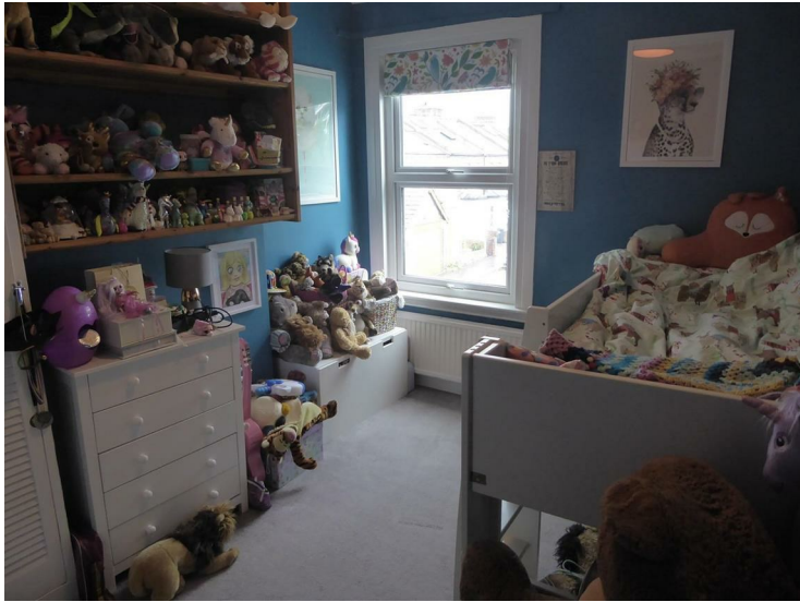
Rear aspect double glazed window, radiator, built-in cupboard housing combi boiler.