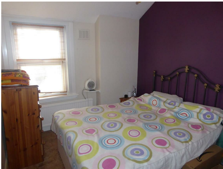
Rear aspect double glazed window, radiator, power point.