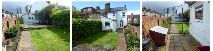
Paved patio area leading onto concrete pathway with spacious shrub borders, laid to lawn area, raised crazy paved patio, access to garage, side access.